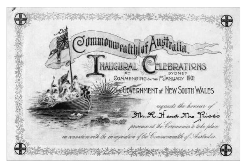
Invitation to the Inaugural Commonwealth Celebrations Family collection

in Sydney as the representative of the City Council.